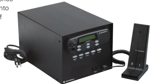
Control Station (RLN5403A) and Desktop Microphone (RMN5068A), shown with a CDM1250, all sold separately.

The CDM Control Station converts a CDM Professional Series mobile into a convenient base station. The radio mounts into the lightweight, portable chassis, containing a full range of front panel control buttons plus an internal microphone, speaker and power supply. A front connector allows for a range of external audio accessories; including a desk microphone, tone or DC remote adapter and telephone interconnect. Additional desktop tray and microphone options are available for simple base station operation.